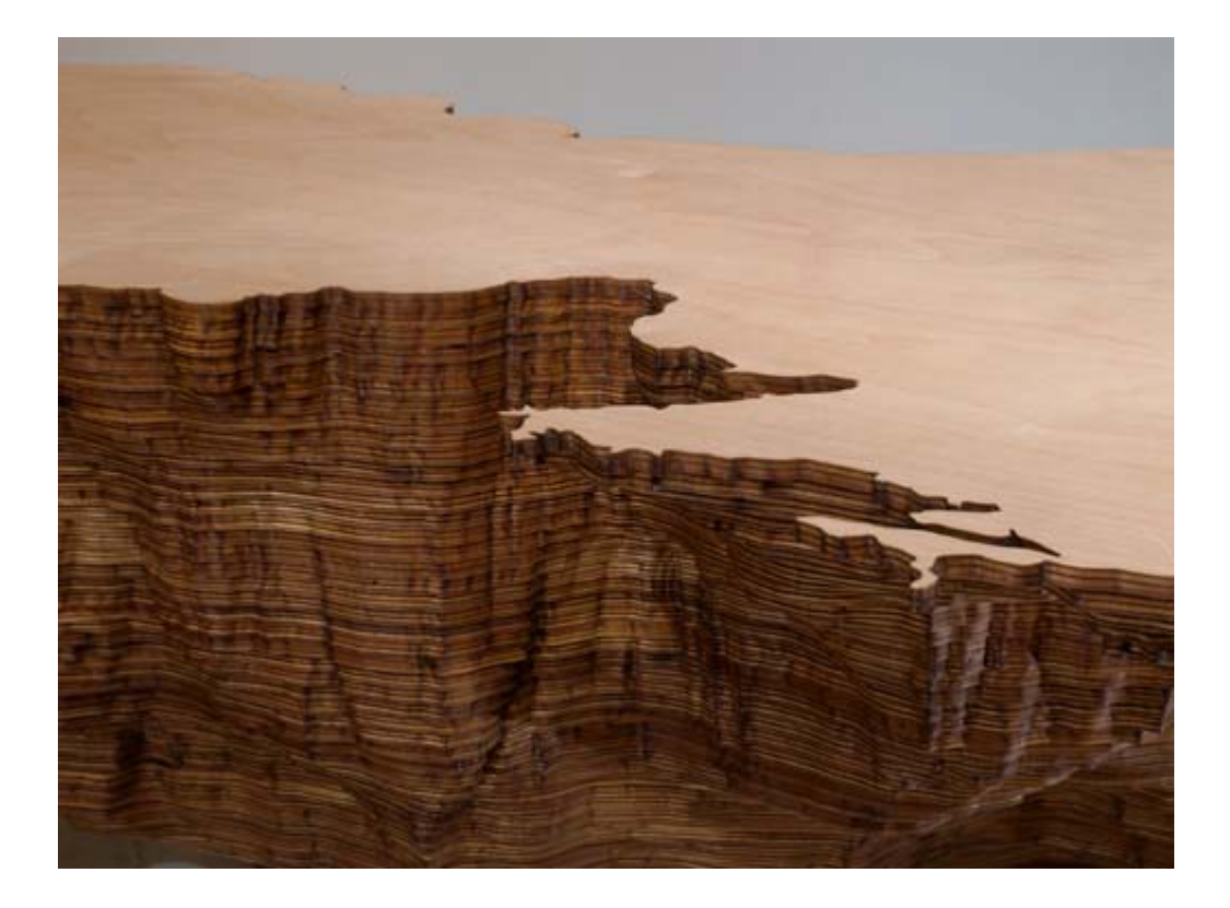
Figure 9: Maya Lin Detail of Black Sea (Bodies of Water series) , 2006 Baltic birch plywood 18-3/8" x 59-3/4" x 33-3/8" (46.7 cm x 151.8 cm x 84.8 cm), sculpture 33-1/4" x 24" x 16" (84.5 cm x 61 cm x 40.6 cm), base

As mentioned before, the Systematic Landscapes have a more overtly political nature than some of Lin's earlier works. The series of altered books Atlas Landscapes (Figs. 10, entire and 11, detail) is probably the most subtly subversive work in the whole exhibit. Lin has carved imaginary topographical lines into the pages of old atlases. "Maps are inherently political—how we choose to present the world graphically will inevitably alter our perception of it" (Lin 6:27).