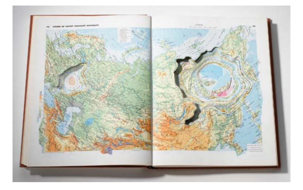
Figure 10: Maya Lin Atlas Landscape The University Atlas, 1984, 2006 recycled atlas 1" x 19" x 12-1/4" (2.5 cm x 48.3 cm x 31.1 cm), open 1-3/8" x 9-3/8" x 12-1/4" (3.5 cm x 23.8 cm x 31.1 cm), closed Photo by: G.R. Christmas/ Courtesy PaceWildenstein, New York © Maya Lin Studio, Inc., courtesy PaceWildenstein, New York

The Washington Post critic, Phillip Kennecot, has accused Lin of not actively engaging real environmental issues. He argues that the gallery pieces are a form of retreat and that her subjective inquires into these natural phenomena are irrelevant (Kennecot 144). In her review of Systematic Landscapes, Suzette Min asserts that the gallery works have less power to move people than her memorials and earthworks (Min 210). Perhaps they do not share the same initial impact of the Vietnam Veteran's Memorial or earthworks, because of their lack of shared cultural history or their limited scale, but the way that Lin creates artwork to enhance and remind us of the beauty and fragility of the landscape still inspires. The way that some of the pieces appear to invade or overwhelm the gallery also mimic the way we have overwhelmed and dominated our environment. Lin's sculptures resonate with the viewer, whether it is by sparking a memory, or by challenging our ideas of global responsibility, or by revealing previously overlooked or unseen aspects of the landscape. In her own quiet way, Maya Lin encourages us to leave the gallery setting and to look at the land around us with a critical eye towards our impact on the environment. Rather than pushing us towards environmental activism with a sense of guilt, she only encourages us to experience and truly enjoy our world.