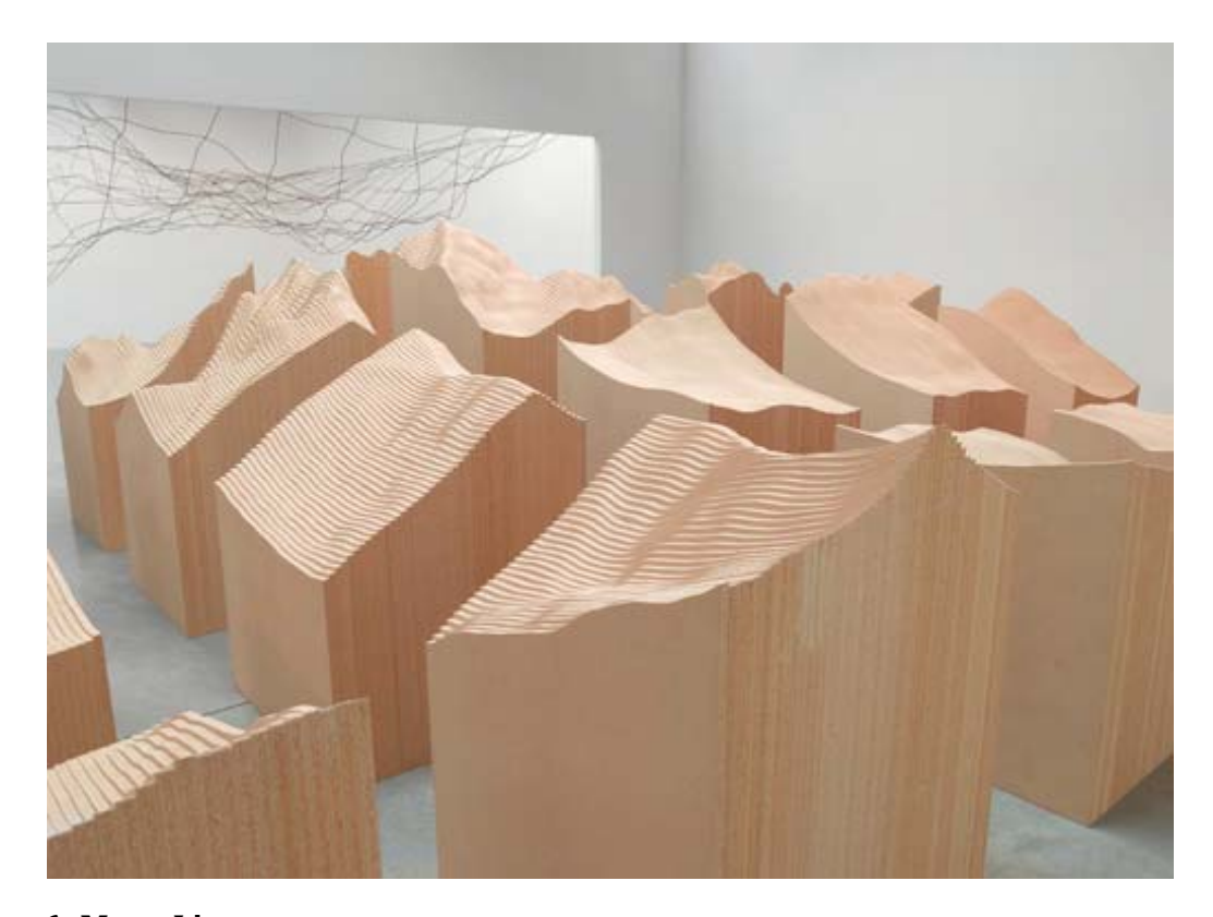
Figure 6: Maya Lin Blue Lake Pass , 2006 Duraflake particleboard installation dimensions variable overall installed: 5' 8" x 22' 5" x 17' 6" (172.7 cm x 683.3 cm x 533.4 cm) 20 block, each from 30" x 36" x 36" (76.2 cm x 91.4 cm x 91.4 cm) to 68" x 36" x 36" (172.7 cm x 91.4 cm x 91.4 cm Photo by: G.R. Christmas / Courtesy PaceWildenstein, New York © Maya Lin Studio, Inc., courtesy PaceWildenstein, New York

Maya Lin Water Line, 2006 aluminum tubing and paint 19' x 30' x 34' 9" (579.1 cm x 914.4 cm x 1,059.2 cm) Photo by: G.R. Christmas / Courtesy PaceWildenstein, New York © Maya Lin Studio, Inc., courtesy PaceWildenstein, New York