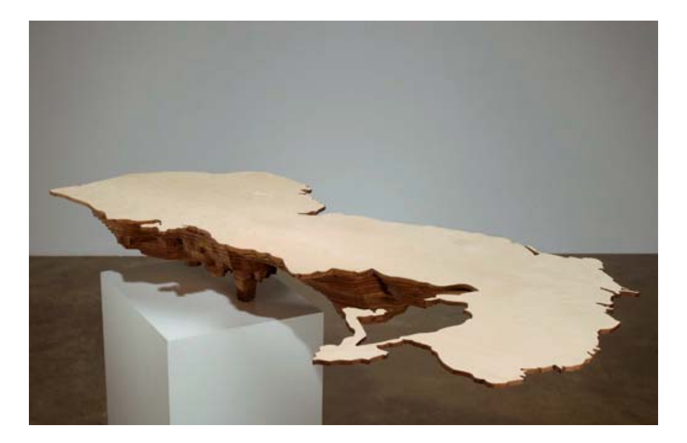
Figure 7: Maya Lin Caspian Sea (Bodies of Water series) , 2006 Baltic birch plywood 19" x 58-1/2" x 32-7/8" (48.3 cm x 148.6 cm x 83.5 cm), sculpture 36-1/2" x 20" x 16" (92.7 cm x 50.8 cm x 40.6 cm), base Photo courtesy PaceWildenstein, New York © Maya Lin Studio, Inc., courtesy PaceWildenstein, New York

The Caspian Sea (Fig. 7), Black Sea (Figs. 8 and 9), and Red Sea (Fig. 1) form a group of sculptures also called Bodies of Water . <sup>9</sup> This group from the Systematic Landscapes series is based upon the contours of the inland seas. In each piece, the surface of the sea is represented by using a smooth, flat plane. The depth of the sea has been exaggerated, in order to call attention to the unseen ecosystems that are concealed beneath the waves of the sea (Beardsley 86). Blue Lake Pass is considerably larger in scale than each individual sculpture of a sea, but when both are compared to the real site that they reference, this difference seems rather minute. By making the scale of a mountain range the size of a room or by making a sea the size of table, Maya Lin has given the viewer a novel perspective. This perspective might be humorous in light of how small a mountain or sea now seems, but it might more accurately describe the true balance of power in nature; indeed, we may appear small standing next to a real mountain, but the consequences of our actions can have devastating effects on our surroundings.