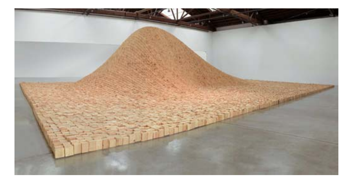
Figure 4: Maya Lin 2 x 4 Landscape, 2006 SFI certified wood 2 x 4s 10' x 53' 4" x 35' (304.8 cm x 1,625.6 cm x 1,066.8 cm)

When compared with 2x4 Landscape, the installation Water Line (Fig. 5, in the foreground), from the Systematic Landscapes series seems more like a drawing in space. Its aluminum tube frame traces out the forms of an underwater mountain range and Bouvet Island near Antarctica. Although the changing patterns made by the contour lines of the mountains are enough to interest a casual observer, the underwater environment that is available for perusal might challenge someone to imagine the unseen in our immediate environments (Beardsley 86). The sculpture is suspended from the walls of the gallery, and the viewer walks below the surface of the ocean floor. Although the title of the piece is Water Line, there is an ambiguity as to where the actual boundary between water and sky is located. By erasing this boundary, Lin challenges us to connect what we might normally see as two separate environments (Lebowitz 156).