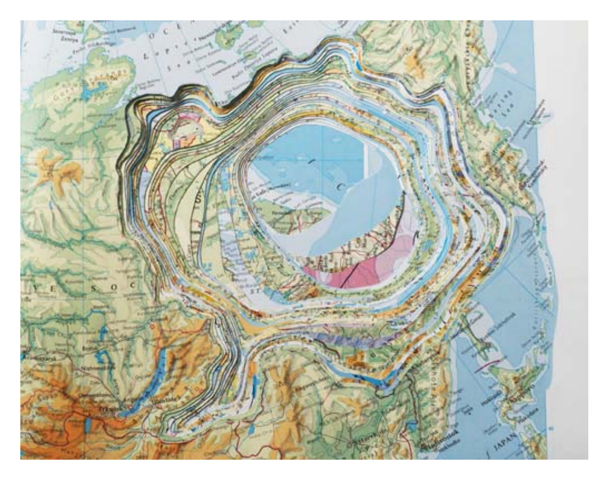
Figure 11: Maya Lin Detail of Atlas Landscape The University Atlas, 1984, 2006 recycled atlas 1" x 19" x 12-1/4" (2.5 cm x 48.3 cm x 31.1 cm), open 1-3/8" x 9-3/8" x 12-1/4" (3.5 cm x 23.8 cm x 31.1 cm), closed Photo by: Richard Marx Tremblay/ Courtesy PaceWildenstein, New York © Maya Lin Studio, Inc., courtesy PaceWildenstein, New York