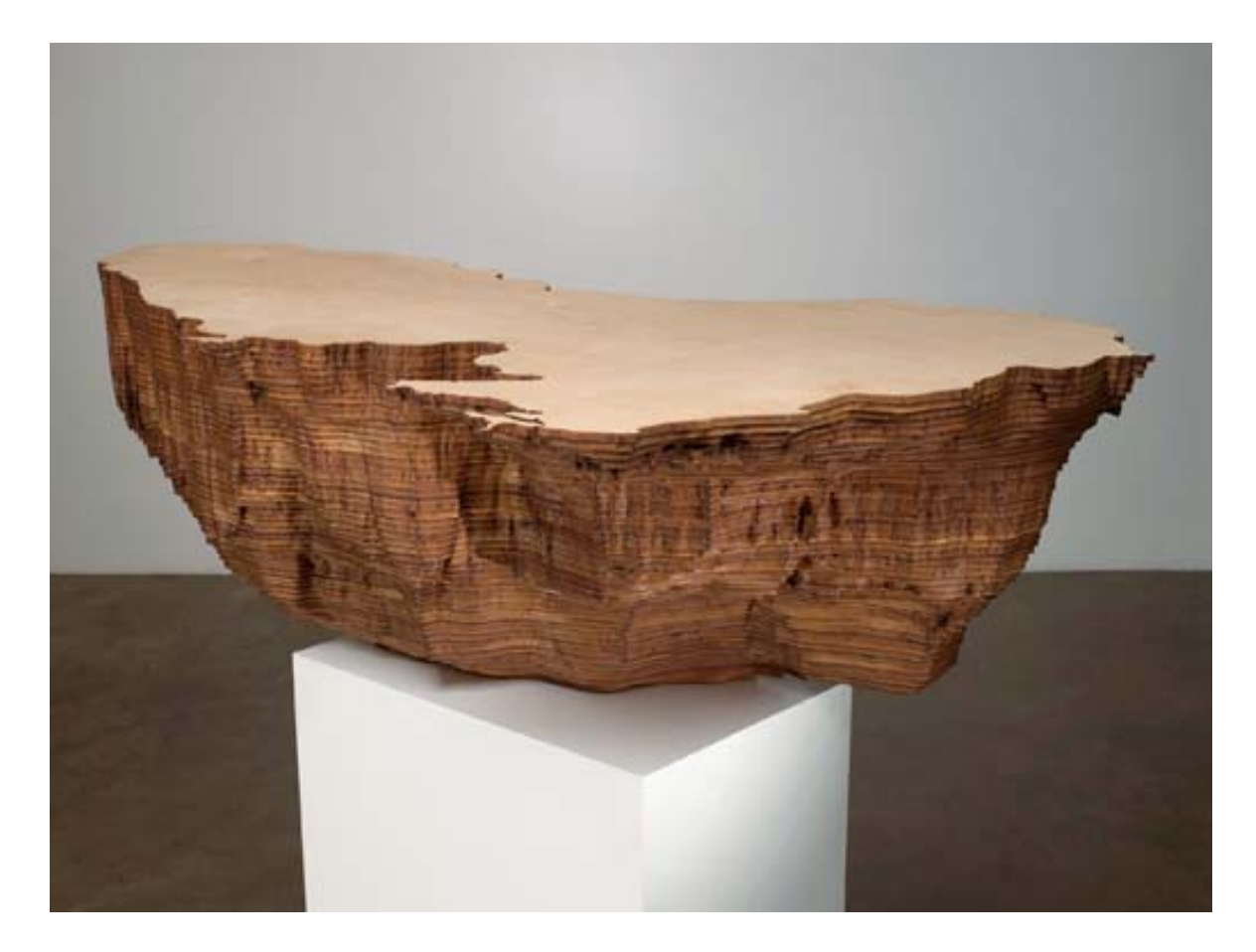
Figure 8: Maya Lin Black Sea (Bodies of Water series), 2006 Baltic birch plywood 18-3/8" x 59-3/4" x 33-3/8" (46.7 cm x 151.8 cm x 84.8 cm), sculpture 33-1/4" x 24" x 16" (84.5 cm x 61 cm x 40.6 cm), base

By making direct references to actual places, Lin creates a nostalgic connection between the viewer and the specific physical space. Although talking about some ocean landscapes, Lin admits, "Maybe I'm naive . . . [the ocean terrains] are something we've forgotten, and therefore we pollute because we've forgotten. If you look at it, I think you'll take care of it" (Lin qtd. in Hines 114). Lin is not only bringing these spaces into the limited room of the gallery but also creating a space within the viewer's psyche for these endangered places. This connection helps the viewers to experience the landscape by proxy; however, induced to imagine the omitted details of the landscape, the audience is actively involved in shaping the environment—and from here, it seems an easy step to become concerned about the actual physical location itself.