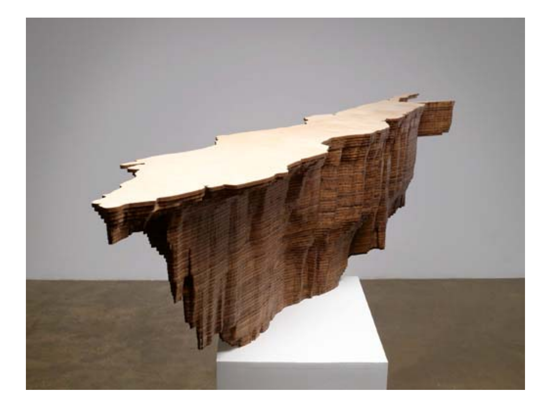
Figure 1: Maya Lin Red Sea (Bodies of Water series) , 2006 Baltic birch plywood 21" x 92-1/2" x 17" (53.3 cm x 235 cm x 43.2 cm), sculpture 31" x 30" x 18" (78.7 cm x 76.2 cm x 45.7 cm), base

examine the ways in which Lin connects the viewer to the landscape. (Highlights from the Topologies series include: Avalanche, Rockfield, Flatlands, and Topographic Landscape . The pieces from Systematic Landscapes will include: 2x4 Landscape, Water Line, Blue Lake Pass, Bodies of Water, and Atlas Landscape).