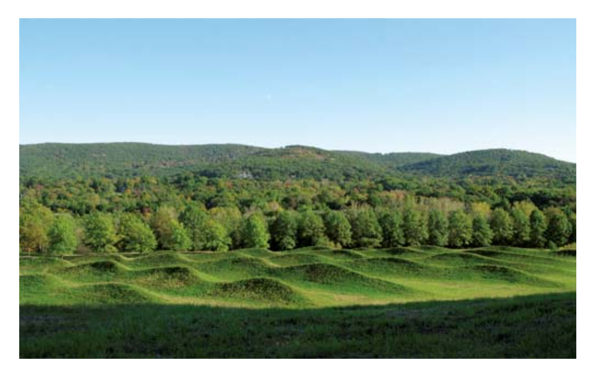
Figure 3: Maya Lin Storm King Wavefield , 2008 4 acres Installed at Storm King Art Center, Mountainville, New York

Topographic Landscape, from the Topologies series, is the place that the gallery meets Lin's earthworks.<sup>6</sup> The sinuous lines cut into layers of particleboard create an undulating field of waves that allude to sand dunes and snowdrifts. While this large-scale sculpture shares the same visual properties as its outdoor cousins—they are all "inspired by the textures made in sand and the action of waves"— Topographic Landscape is much farther removed from nature (Cotter 8). Despite the further minimizing and abstracting, it is amazing that the use of materials so far removed from their natural form by the manufacturing process can so adeptly mimic the essence of the landscape from which they came.